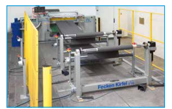
Splitting Machine K 21 and R 10 and two R 39.

Equipment: For the production of roll goods, the machines K and D can be equipped with a Wind-Off Machine R 10 and two Wind-Up Machines R 39 or R 88.