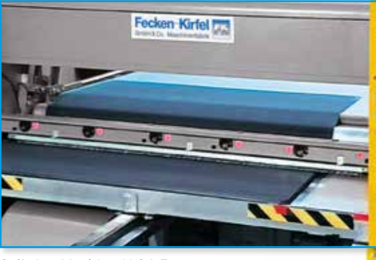
Splitting Machine H 24 F.

Equipment: Drives, table and vacuum of the H 24 G are reinforced. Additional rollers support the upper roller.