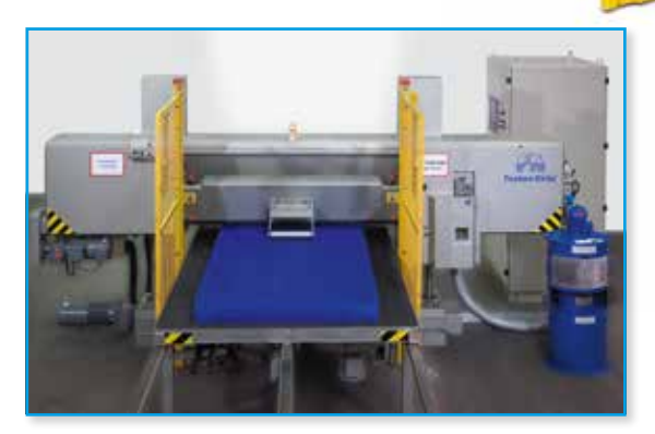
Splitting Machine H 24 G.