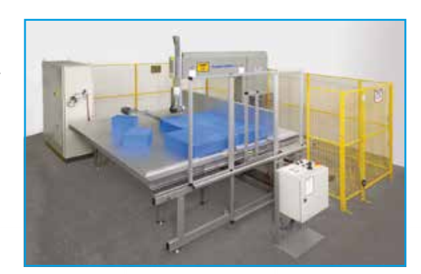
Vertical Bandknife Cutting Machine V 51/5.