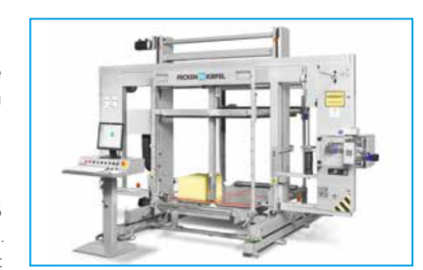
Horizontal Contour Cutting Center C 56.

Equipment: The oscillation technology is ideal for cutting technical materials, as well as contours with sharp edges or small radii with small tolerances. Wear parts are minimized, what makes this machine especially economic.