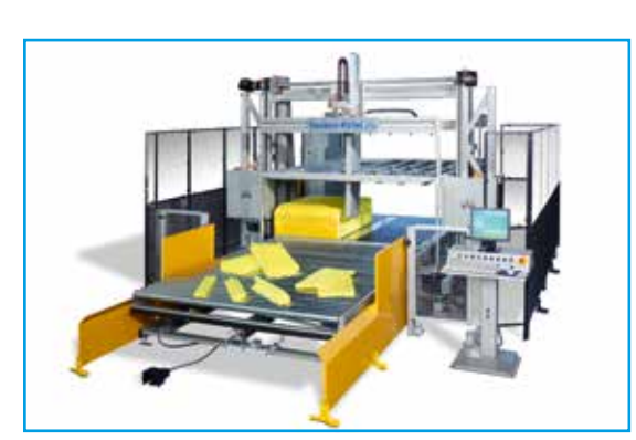
Horizontal Contour Cutting Center C 69.