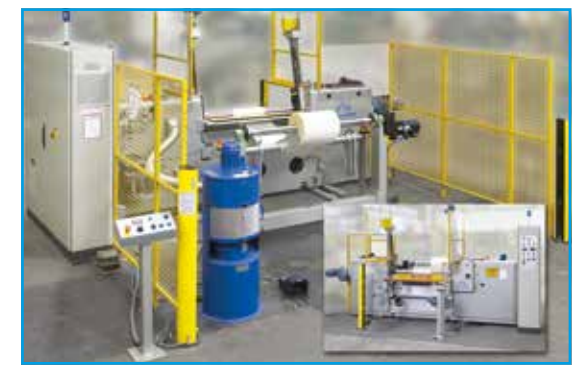
Peeling Machine R 23.

Material: The R 24 peeling machine is used for the production of webs and foils from reconstituted bonded rubber, polyurethane elastomers (full "Vulkollan"), and similar materials.