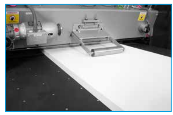
Splitting Machine H 24 G with optional feeler roller

Material: Reconstituted bonded rubber, hard cellular rubber, hard polyethylene, hard EVA, UHMW, rubberized cork, and similar hard materials.